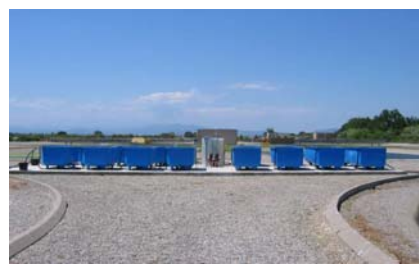
STP Empuriabrava, Costa Brava, Spain