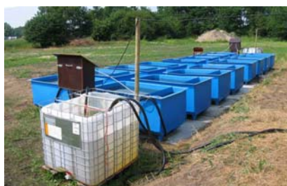
STP Horstermeer, The Netherlands